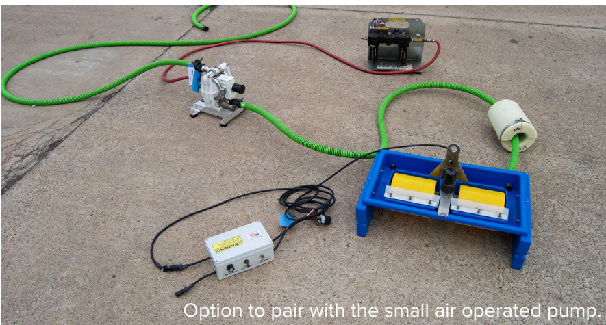
Option to pair with the small air operated pump.

Single-chamber, self-priming diaphragm pump with non-choke valves. The pump can be run dry and can also handle a mixture of air and water without difficulty. It is self-priming up to a height of 9.8 ft / 2.9 meters. With its low pulse and muffled rubber bracket, this pump offers quiet operation. Note: Requires controller to operate (supplied with Mini Skimmer or sold separately).